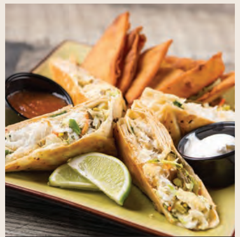
Cabo Fish Tacos

Hand-battered cod dusted with Cajun seasoning and wrapped in a grilled flour tortilla with house-made coleslaw, jalapeños, pineapple, and cilantro. Served with sour cream, crispy pita chips, and salsa. 12.49