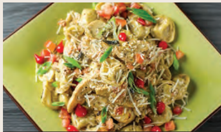
Cajun Chicken Tortellini