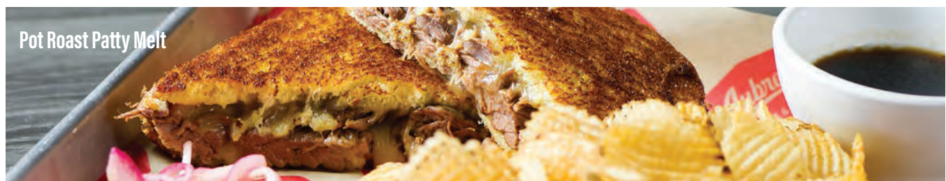
Pot Roast Patty Melt