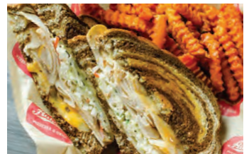
Aubree's Turkey Reuben