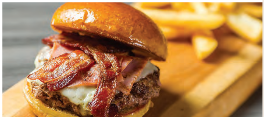
Old Detroit Burger

Topped with Bavarian ham, Applewood smoked bacon, and swiss cheese. 10.99