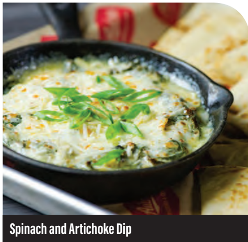
Spinach and Artichoke Dip

Fresh chicken breast sliced into strips and coated with a crispy coconut crust, served with mango chutney and sweet chili dipping sauce. 9.99