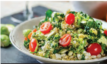
Shaved Brussels Sprout Salad A GF

Dressings Buttermilk Ranch Caesar Fat Free Italian Fat Free Raspberry Vinaigrette Lemon-Dijon Vinaigrette Creamy Italian Greek Bleu Cheese Honey Mustard Red Wine Vinaigrette