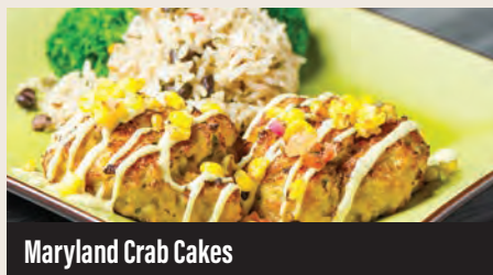
Maryland Crab Cakes

Aubree's take on Maryland-style crab cakes features Jumbo Lump blue crab meat, topped with roasted corn salsa and mustard aioli. Served with black bean rice and steamed broccoli. 15.99