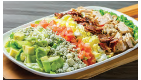
Coronado Cobb Salad GF