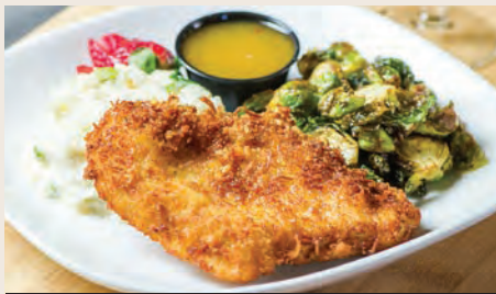
Coconut Grove Chicken A

Fresh chicken breast coated with a crispy coconut crust and served with mango chutney. Choice of two classic sides (add signature sides for just $1 each). 13.99