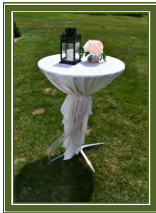
Table Runners Available in gold and rose gold glitz $4.00 each